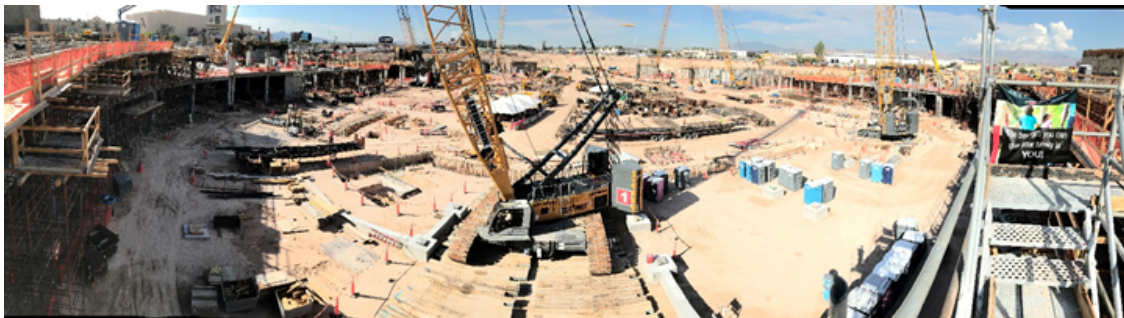
Panoramic view of the bowl viewed from Main Concourse elevated deck.

As of July 9, 2018 approximately 18,202 out of an estimated total of 104,708 cubic yards of concrete have been poured. The total number of columns poured is 230, 161 on the field level and 69 on the mezzanine level. As of July 9, ten deck pours were completed.